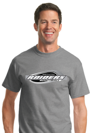
T-SHIRT SCREEN PRINT Item No. PC61(ADULT) / PC61Y(YOUTH)