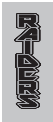
SWEAT PANTS SCREEN PRINT IMPRINT: BLACK