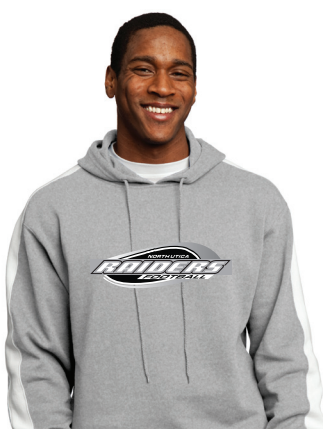
HOODIE SCREEN PRINT Item No. F264(ADULT) / Y264(YOUTH)