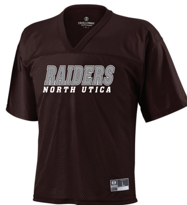
FOOTBALL JERSEY SCREEN PRINT Item No. 229502 (ADULT) 229522 (YOUTH)