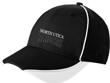
NEW ERA HAT Embroidered Item No. NE105