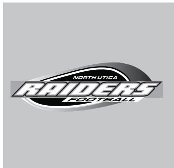
T-SHIRT & HOODIE SCREEN PRINT IMPRINT: WHITE

2XL is $2.00 more 3XL is $3.00 more 4XL is $4.00 more