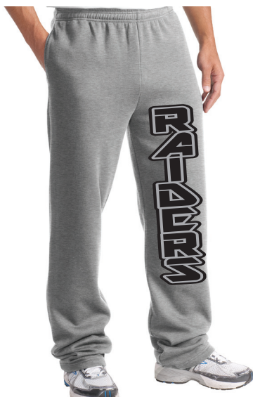
SWEAT PANTS SCREEN PRINT Item No. ST257 (ADULT) Y257 (YOUTH)