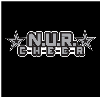
T-SHIRT & HOODIE SCREEN PRINT IMPRINT: WHITE/ METALIC SILVER