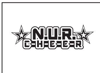
DRAW STRING BAG SCREEN PRINT IMPRINT: BLACK