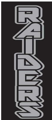
PAJAMA PANTS SCREEN PRINT IMPRINT: METALIC SILVER